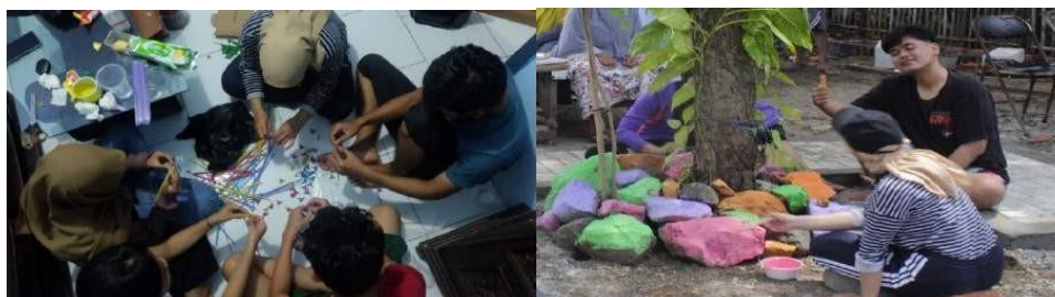
Figure 7. Decorating Process

The next day the team continued the second phase, starting with making 3D paintings at the entrance to the Cumi park, planting medicinal plant seeds around the garden and installing paving blocks. Apart from decorating the stones with colorful paint, the team also made ornaments out of straws as shown in Figure 7. This was done so that the park looked colorful, bright and could invite people from other villages to visit the Cumi Park.