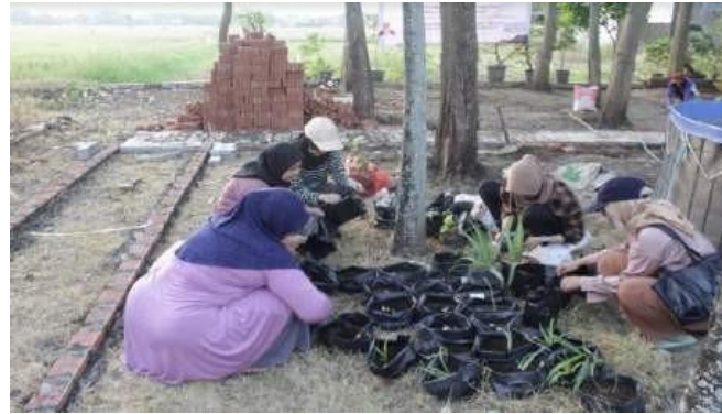
Figure 5. Collaboration between Teams and society