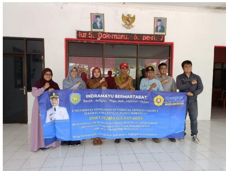
Figure 2. Socialization with team and Pabean Udik Village Apparatus

At this stage, there was a meeting of the team, the village head and the Udik Customs village apparatus. The discussion on this socialization is the program of activities that will be carried out by the team. Figure 2 shown that Pabean Udik apparatus welcomes the desire from the team to effect change in the Cumi village.