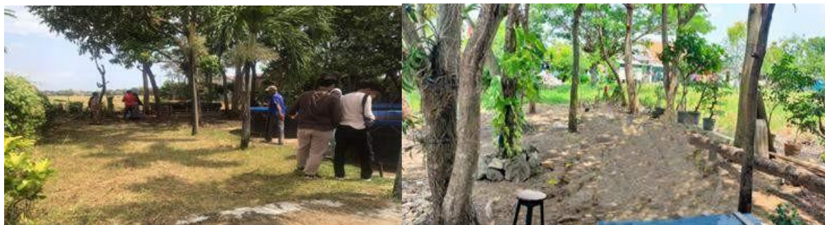
Figure 3. Location of Cumi Village