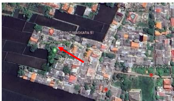
Figure 1. Cumi Village Location Map

Based on the results of a survey conducted by the Lecturer Team, in the Customs area of Indramayu Udik there is one location that still looks shabby even though the place has potential if it is managed with good planning. The location is on Jalan Cumi Pabean Udik Village as shown in Figure 1.