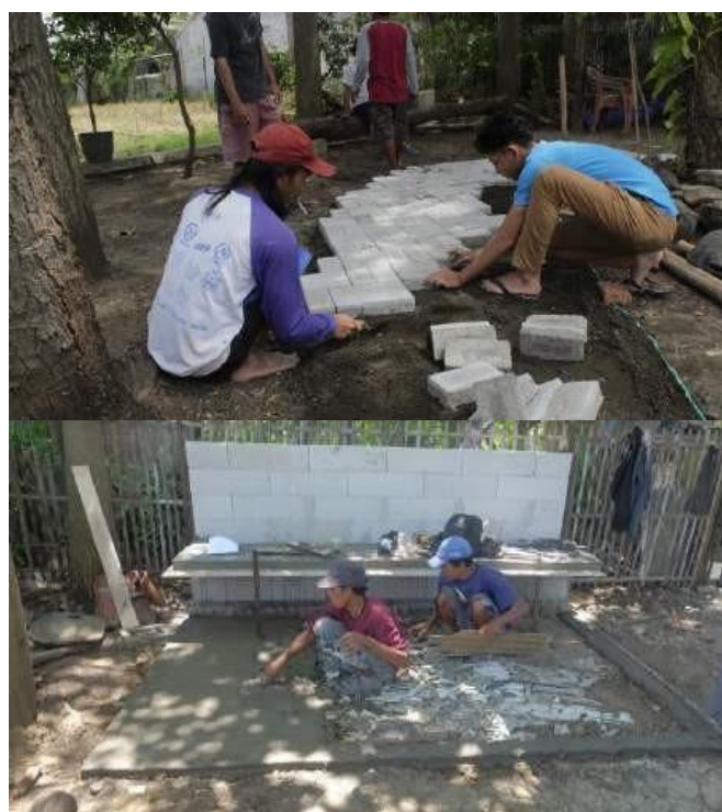
Figure 4. Use of materials for the garden

The process of purchasing tools and materials is carried out in stages. Tools and materials are purchased as needed to avoid wastage and according to their function in this step. In this step, assisted by local residents to make permanent chairs in the Cumi park, shows in the Figure 4. This chair can be used as a place for discussion between residents.