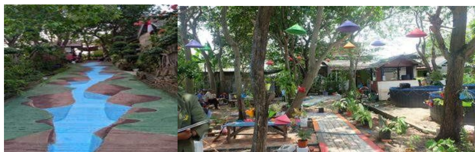
Figure 8. Cumi Park after implementation

Figure 8 shows the results of the 3D paintings made by the team, as well as the placement of several hanging decorations, paving block painting which gives a colorful, bright, clean and beautiful impression.