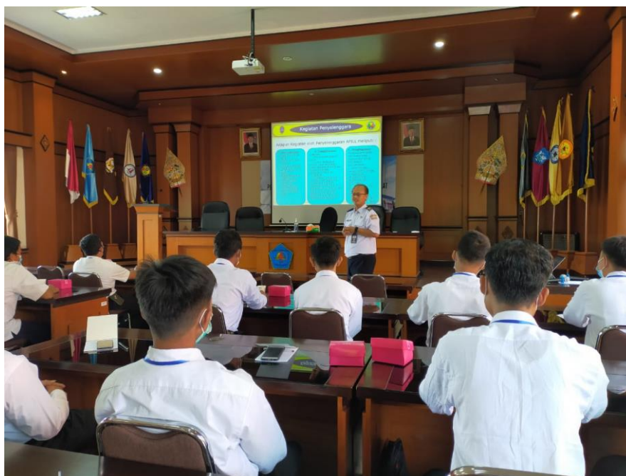
Figure 1. Delivering Material in Class

Figure 1 shows the activity of delivering theoretical material in class to training participants.