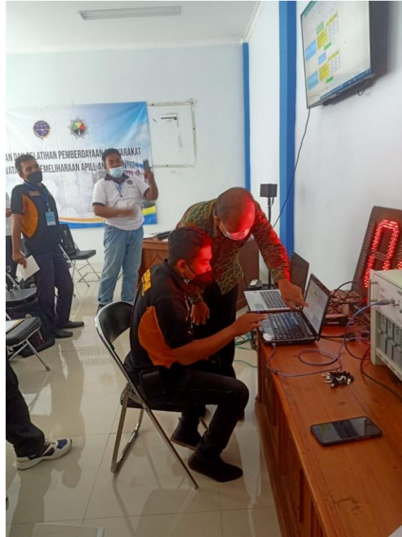
Figure 3. APILL Simulator Practice

To complete the knowledge of the training participants after obtaining theoretical and practical material on field surveys, the training participants then input the data that has been obtained into the APILL simulator, the input data is the time delay in red, yellow and green lights.