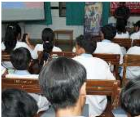
Figure 3. The students filling the evaluation quiz

Student projects were evaluated based on sustainability and innovation criteria, both in school and in everyday behavior. Direct observation during face-to-face activities and analysis of student interactions on the virtual platform in the library provided insight into classroom dynamics and student participation as seen in figure 4.