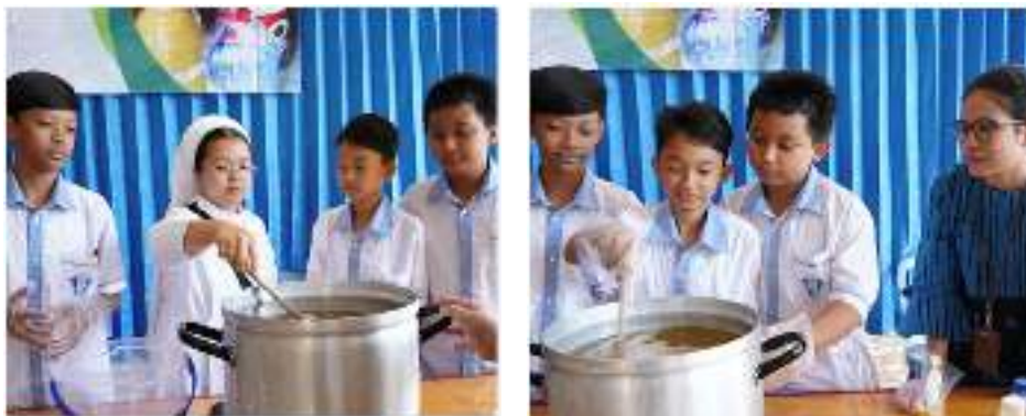
Figure 4. Teachers Observe Students During Face-To-Face Activities

Student projects were evaluated based on sustainability and innovation criteria, both in school and in everyday behavior. Direct observation during face-to-face activities and analysis of student interactions on the virtual platform in the library provided insight into classroom dynamics and student participation as seen in figure 4.