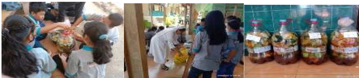
Figure 1. The Making of Eco-Enzyme in Stella Matutina

Experimental Hybrid Learning in transforming the learning experiences of junior high school students in the digital era.