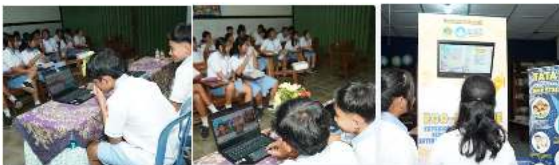
Figure 5. Students Trying the App.

Feedback from teachers and facilitators, both verbally and through digital forms, helped in assessing the effectiveness of the learning modules used. Interviews with students and teachers were conducted to gain in-depth perspectives on the impact of the activities (figure 5).