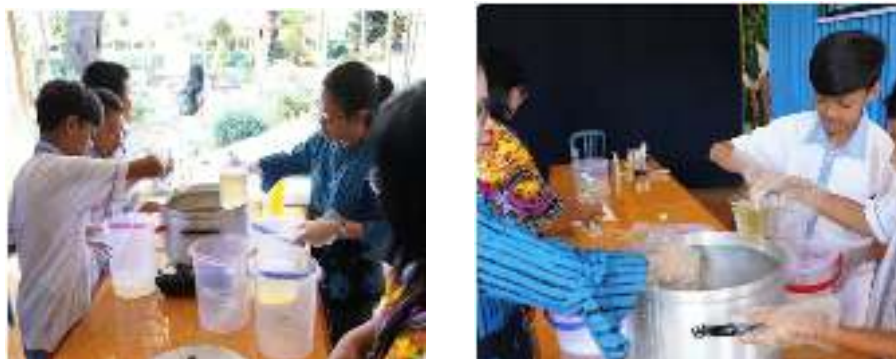
Figure 2. Students Conduct Training in Making Liquid Soap